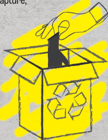
2. Collect used disposable nitrile gloves