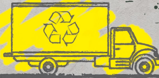
3. Ship & Recycle